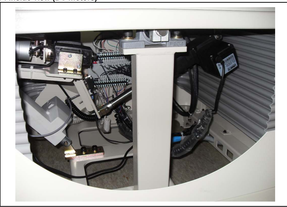
Fig. 5 : Inside view (DC motors)

TRF No.: I601-1_C Page 36 of 36 Ref. No.: STC-A09-095